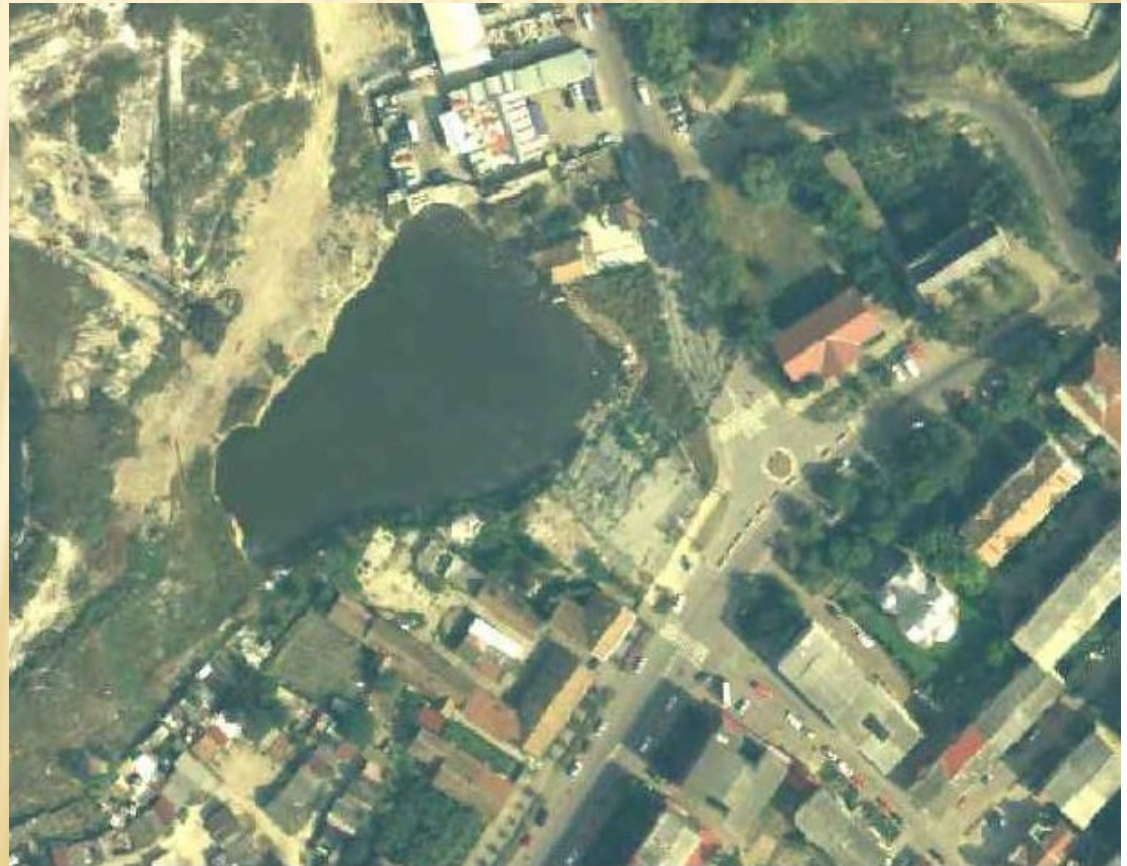
Groapa de la Plus fotografiata din satelit